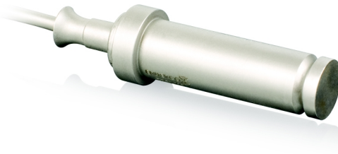
Shown above: The Endevco® 522 series pressure transducer from Meggitt Sensing Systems

Pressure sensors have an inherent mass on the diaphragm end of the sensing crystals, making the sensing system also act like an accelerometer in the presence of high vibration levels. An accelerometer is a device used to detect vibration, a measurement parameter that is undesirable in this application. If some type of acceleration compensation or isolation is not included, the ambient vibration will distort the pressure signal.