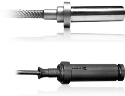
Figure 2: A few examples of Endevco® pressure sensor packages and cables to accommodate a variety of mounting configurations. Both use hardline cable while the top sensor has a protective shield over the cable.

These cables are welded to the transducer with a hermetic connector supplied at the opposite end. Cables can be provided in a coaxial configuration terminating in a 10-32 connector. Many cables are furnished with a multi-pin connector and a two-conductor hardline cable.